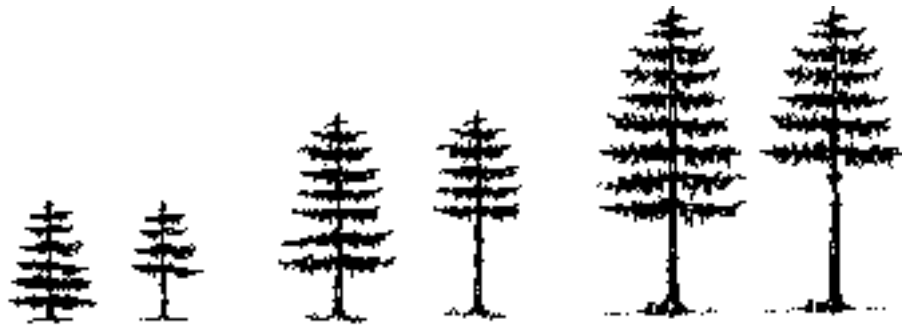
Figure 2. As the tree grows, each successive lift removes the branches below the 50 percent crown level. From Emmingham and Fitzgerald, EC 1457, Pruning to Enhance Tree and Stand Value, courtesy of Oregon State University Extension Service.

bole to be pruned should be about 4–5 inches at the time of each lift (Figure 2). General guidelines for westside Douglas-fir follow: